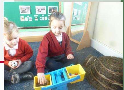
Weighing hedgehogs to see if they are big enough to be released into the wild