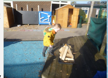
Recreating our bonfire